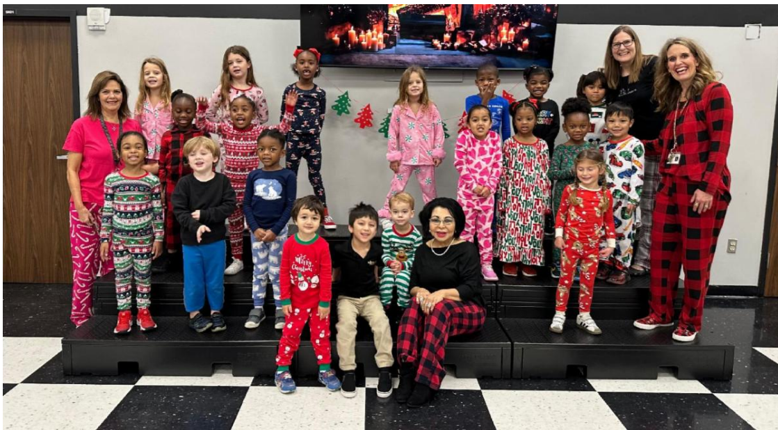
PreK held its first Christmas Chapel on Wednesday morning. The children sang songs about Santa and the Christmas story. They also used the letters of the alphabet to narrate the Christmas story. It was a wonderful way to start the day!