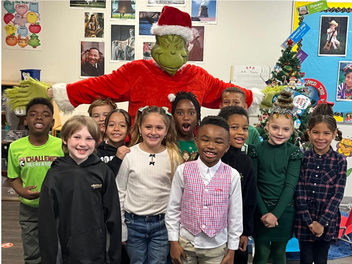
A visit from the Grinch!