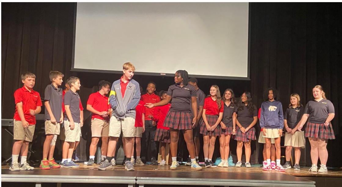
Middle School Lip Sync Competition!