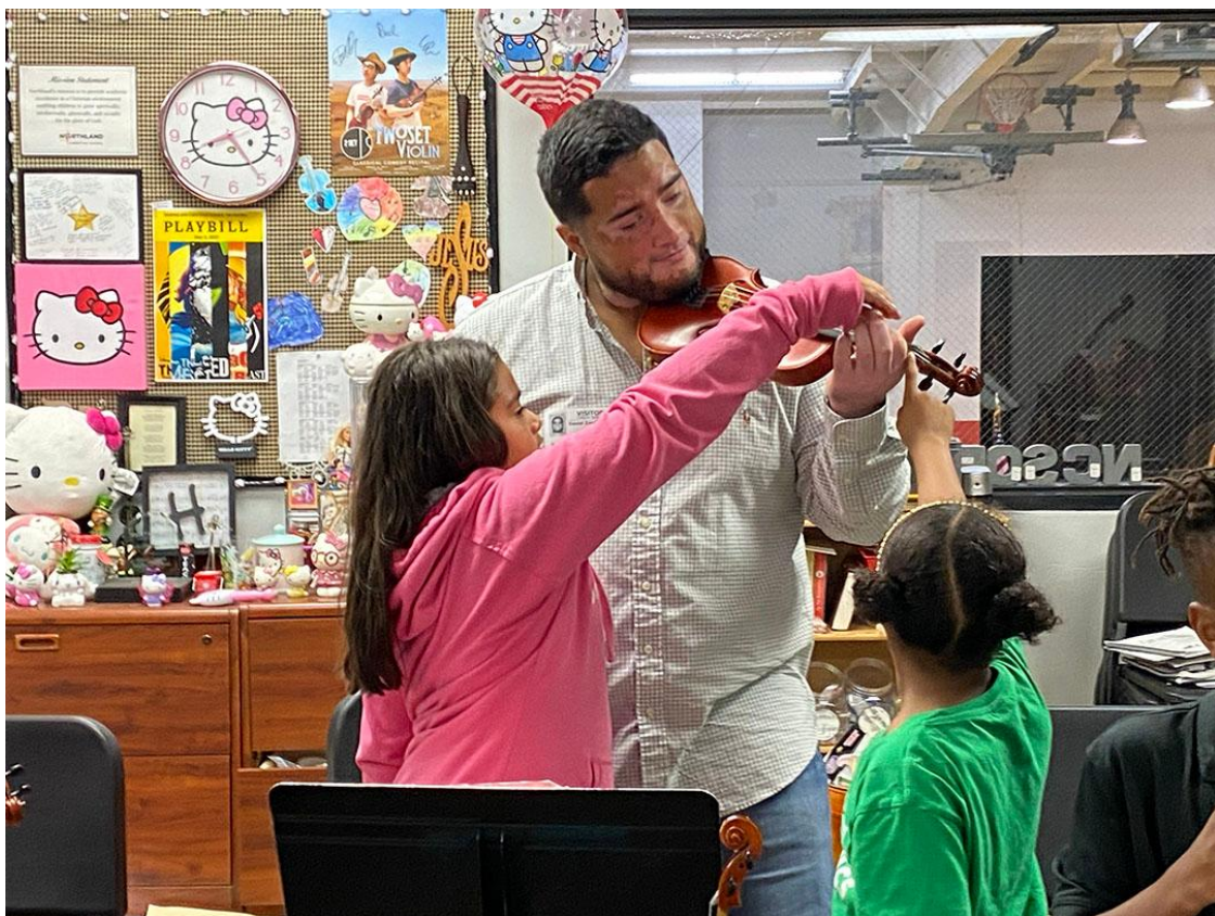
Orchestra students recently taught their parents how to play Hot Cross Buns. Parents are invited to come learn to play on Tuesday, November 12th.